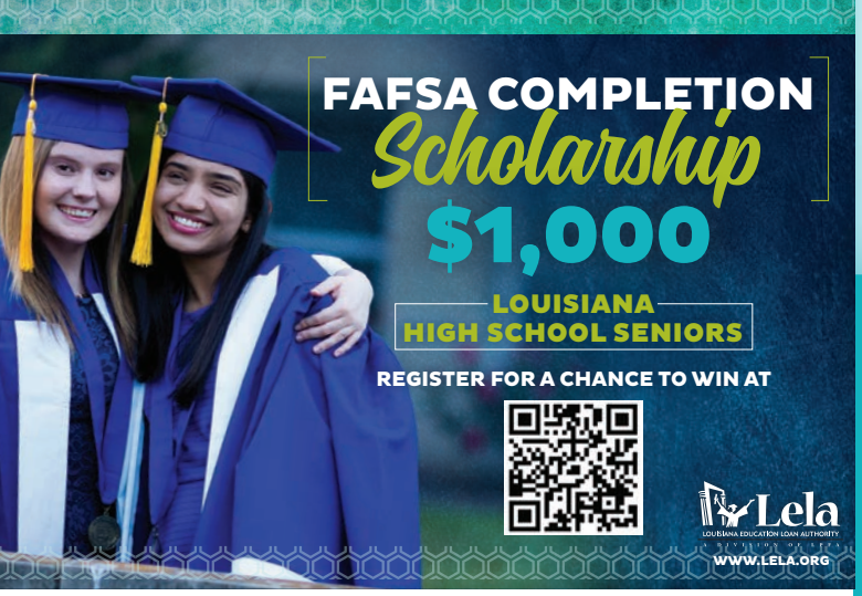
Winners must provide proof of completion from federal student aid, if selected.