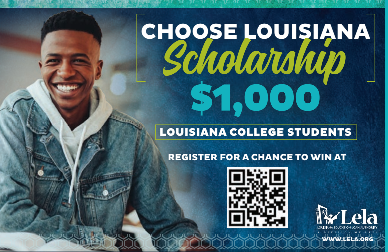
Winners must be enrolled in a Louisiana college or university, if selected.